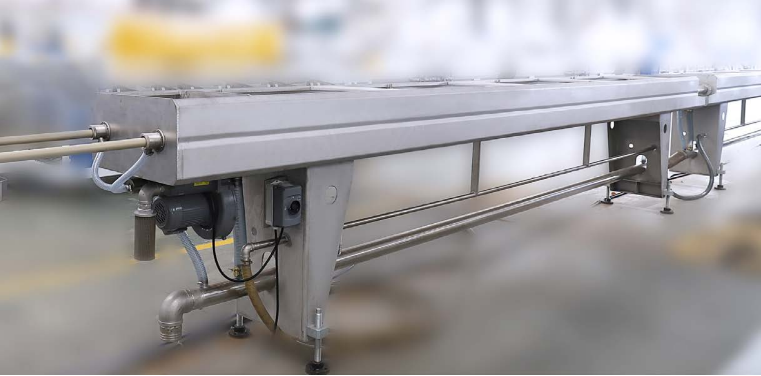
Cooling Tank for dual pipe, 6 meters length x 3 sets