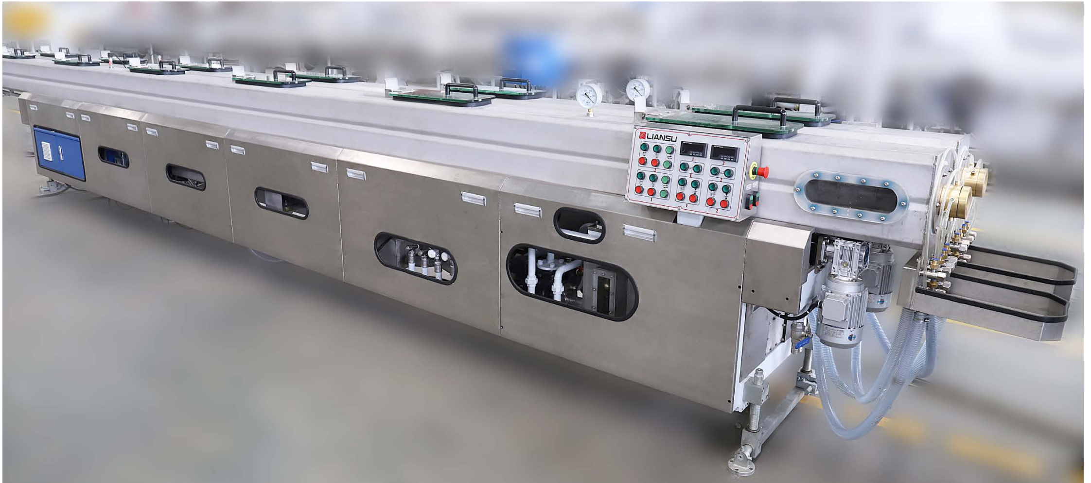
Vacuum Tank: 9 Meters Dual Tank, with Inverter drive, close-loop control Advantage: Automatic vacuum control, Energy Saving